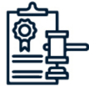
Regulatory and Inspection Bodies