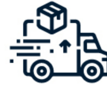
Logistics and Shipping Partners