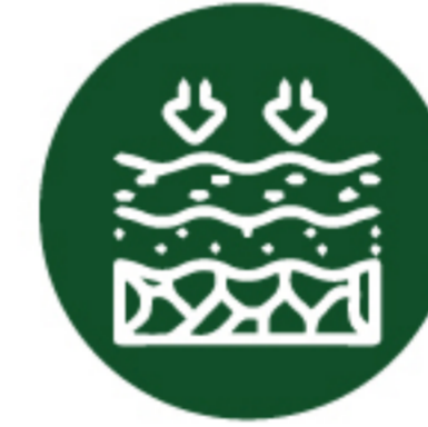
Soil Treatment Solutions

We collaborate with certified manufacturers and regulated supply partners to ensure: