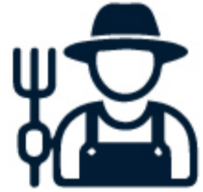
Farmers and Producers