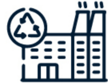
Processors and Recycling Facilities