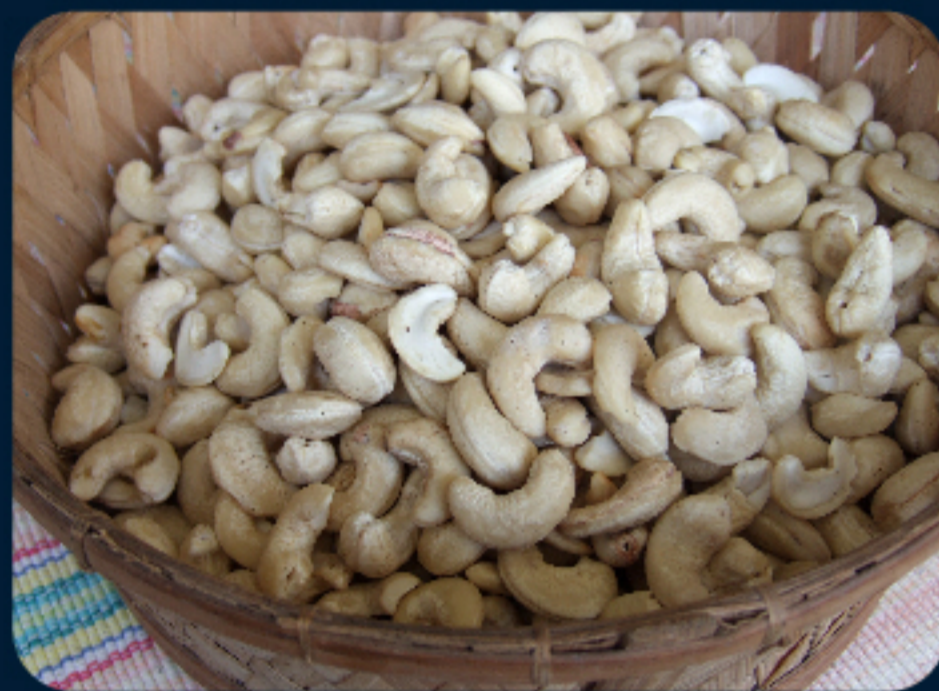
Raw Cashew Nuts

Strong Sourcing Capabilities in Core Commodities.